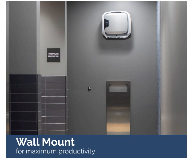
Wall Mount for maximum productivity