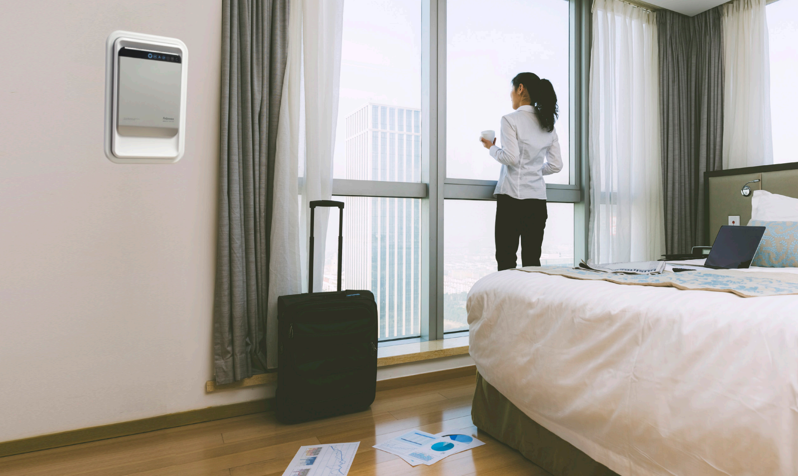
AM2 is shown recessed, making it ADA compliant