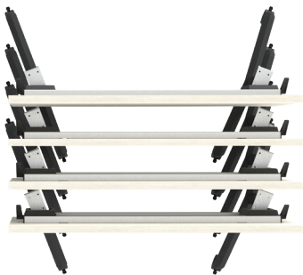
Top view alignment