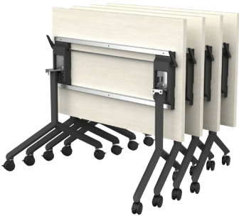
Rotating legs, in-line nesting