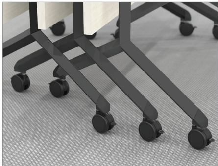
Available in black finish only